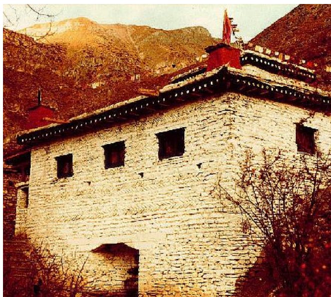
The "Temple Of Miraculous Fire" at Muktinath, Nepal. Photo by Ken Street (Nov. 1979).

[For more on this subject, please read our tract The Temple Of Miraculous Fire .]